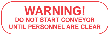
PLACED ON ALL POWERED CONVEYORS NEAR DRIVE AND/OR CONTROLS.

all warning signs. Make certain your personnel are alerted to and obey these warnings. Shown below are typical signs that are attached to this equipment.