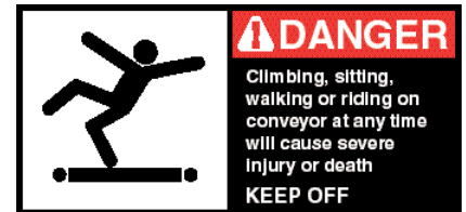
PLACED ON 20 FT. INTERVALS, BOTH SIDES.