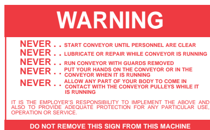
PLACED AT DRIVE OF ALL POWERED CONVEYORS.