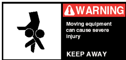
PLACED ON TERMINATING ENDS