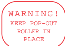
PLACED WHERE POP-OUT ROLLERS ARE USED