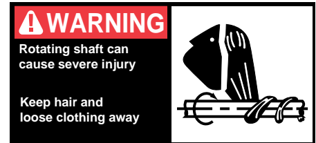
PLACED ON LINE SHAFT SIDE.