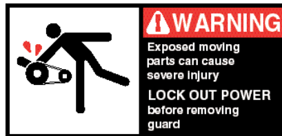
PLACED ON ALL CHAIN GUARDS.