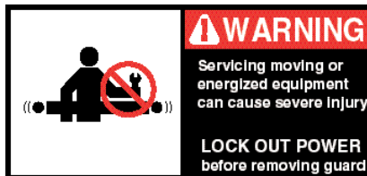
PLACED NEXT TO DRIVE, BOTH SIDES.